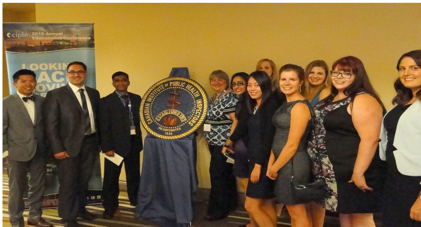
The EHFC Board financially supported the travel of students who attended the national CIPHI AEC in Ottawa.