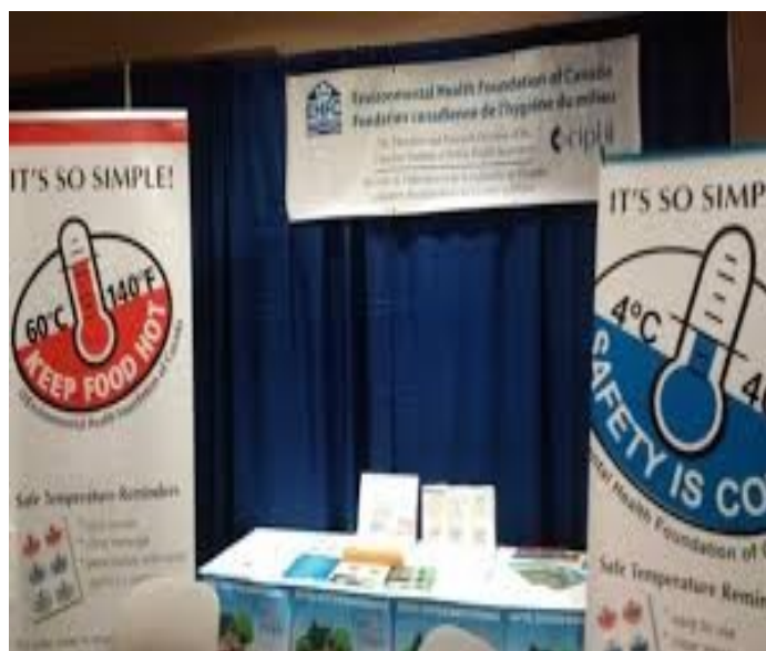
EHFC was a CIPHI Annual Education Conference Exhibitor.