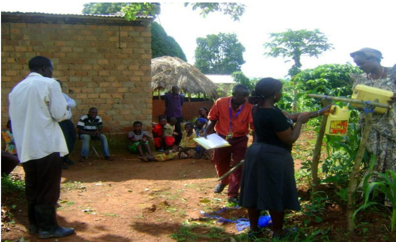
Village Health Team Members and VAD staff conduction demonstration training sessions in local communities