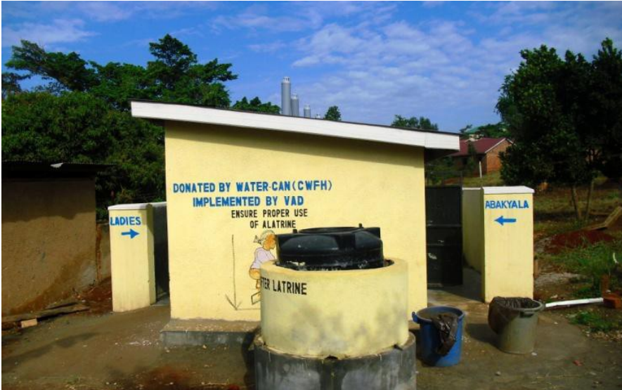
A “talking wall” painted on the side of the women’s latrine block at Ndeje Health Centre helps to reinforce good hygiene practices